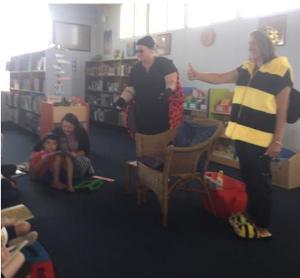
The Lady Bug and the Queen Bee show students how to BE SAFE

At each of our Bee Assemblies students are visited by the "The Bad Tempered Lady Bug" by Eric Carle and the Queen Bee who role model the expectation focus of the week.