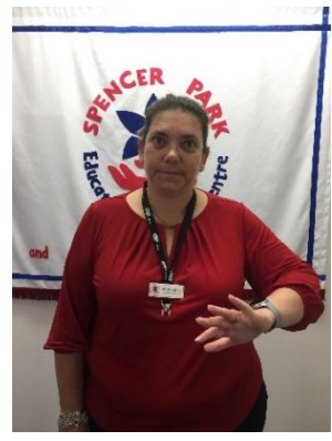
if I don't - move hand sideways across body get what I want - move hand away from body.