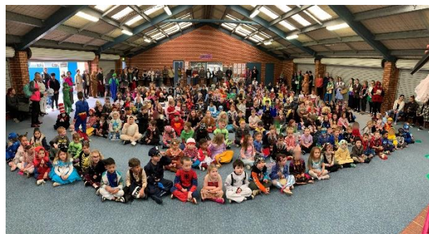
A crowd shot!