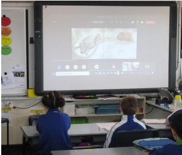
Students in a classroom watching and listening to a read aloud book.