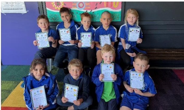
Do Your Best

We congratulate the following students who received certificates at Monday's Mini assembly.