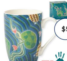
Billabong Dreaming Mug