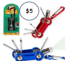
5 in 1 Toolset