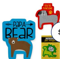
Dad's Fun Magnet