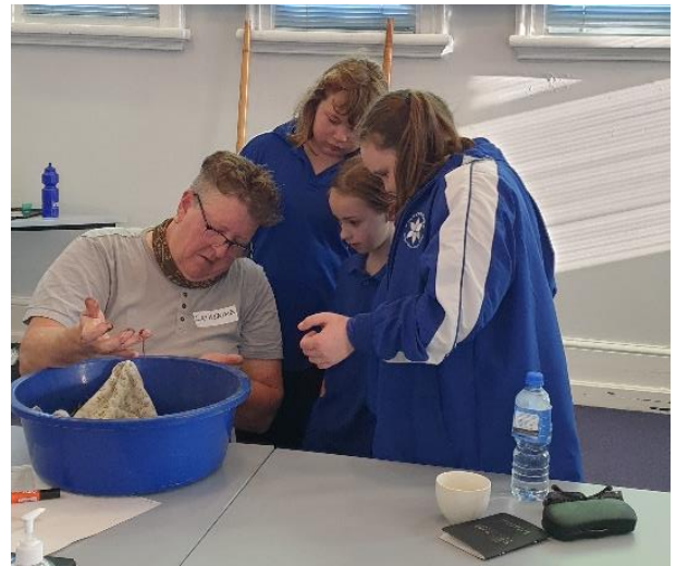
Biomimicry - Ask out attendees which birds inspired the improved design of one of the fastest trains in the world.