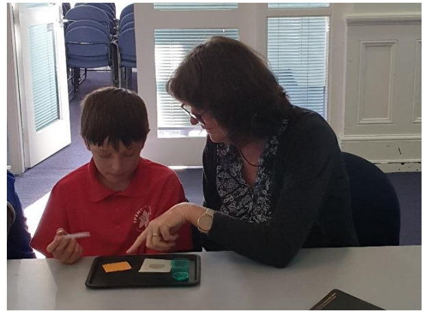
Attendees were given a game to help them decide which type of engineering was of most interest to them.