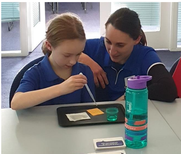
A hands on experiment about hydrophobia after learning about shark skin.