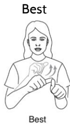
Best Extend thumbs of both hands and hold in front of body, palms down. Move dominant thumb forward..