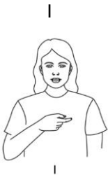
I Point to self using extended dominant index finger. (Natural gesture).

I can be my best in class by following the classroom expectations.